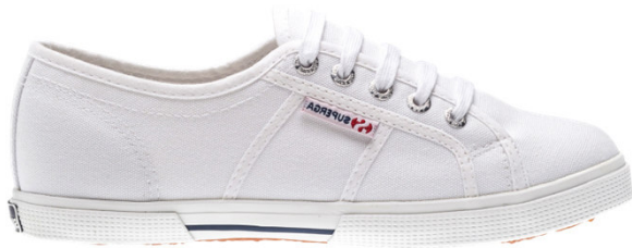
S003IGO 2950 COTU VK 59,95