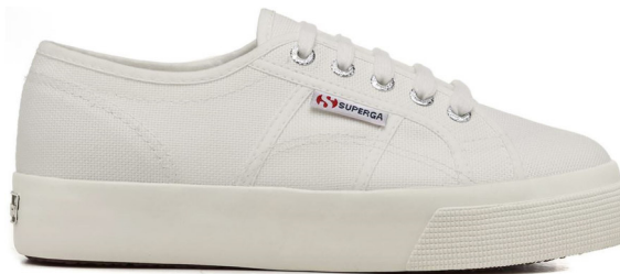
S00C3NO 2730 COTU VK 74,95