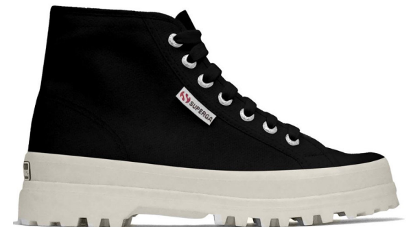
S00GX0 2341 ALPINA VK 89,95