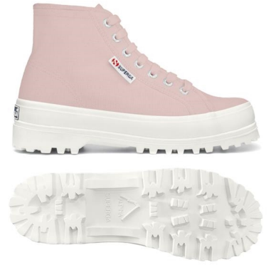
AFB Pink Skin-F Avorio