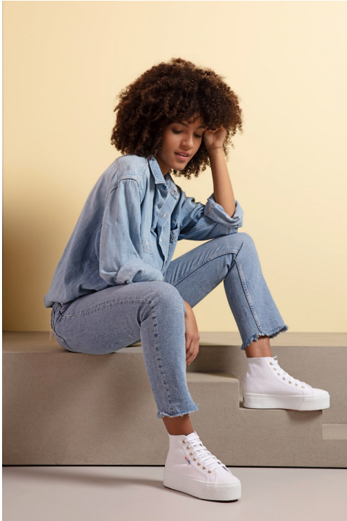
2705 Hi Top