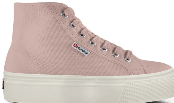
S3111MW 2705 HI TOP VK 79,95