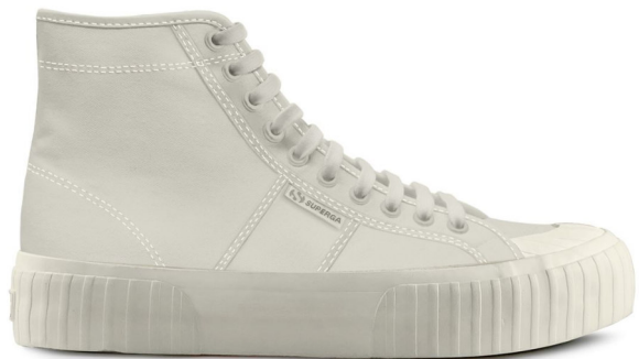
S112I9W 2696 STRIPE VK 79,95