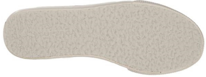
A9W Total Beige Raw