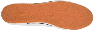
A6N WHITE-PINK SKIN