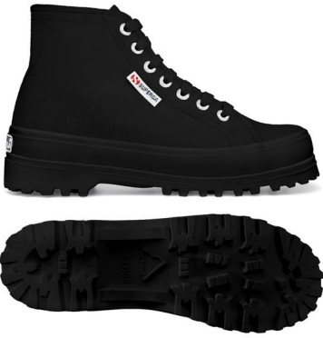
996 Full Black