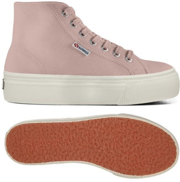
AFB Pink Skin-F Avorio