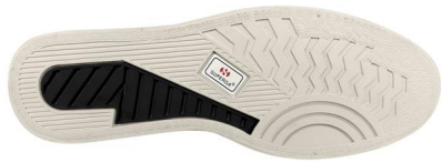
A6L WHITE-WHITE AVORIO