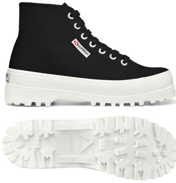
ADK Black-F Avorio