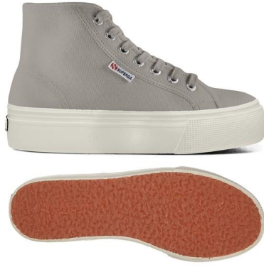
AHN Grey Colomba-F Avorio