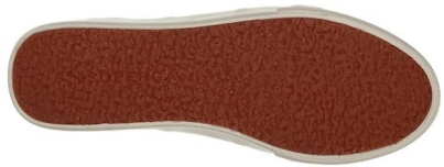
AHK Beige Lt-F Avorio