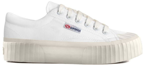
S5111SW 2631 STRIPE PLATFORM VK 89,95