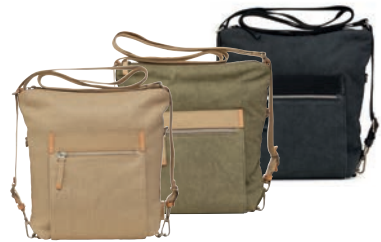
5108 2-Way-Bag 23-33 x 34 x 11 cm RRP 119,00 Euro