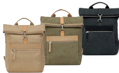
5109 Backpack Courier 26 x 35 x 10 cm RRP 129,00 Euro