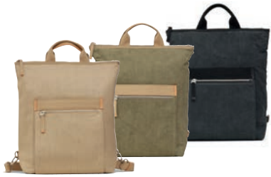
5110 X-Change Bag S 30 x 40 x 12 cm RRP 159,00 Euro