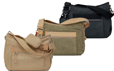
5107 Hobo Bag 30 x 26 x 10 cm RRP 129,00 Euro