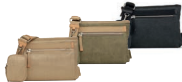
5106 Shoulder Bag 24 x 18 x 4 cm RRP 99,95 Euro