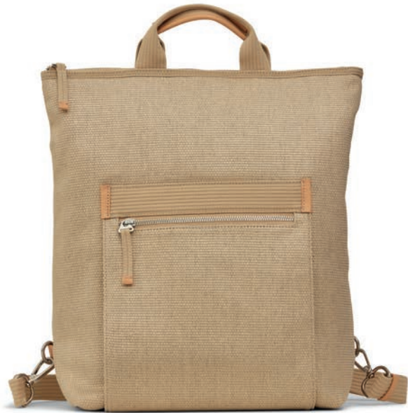
JOST 5110-697 X-Change Bag S 30 x 40 x 12 cm / 11" RRP 159,00 Euro