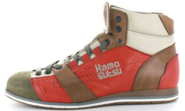
COTTO - SMOG - CAMEL