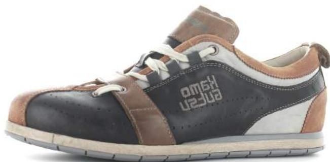
ARANCIO + COCCO ANTRA