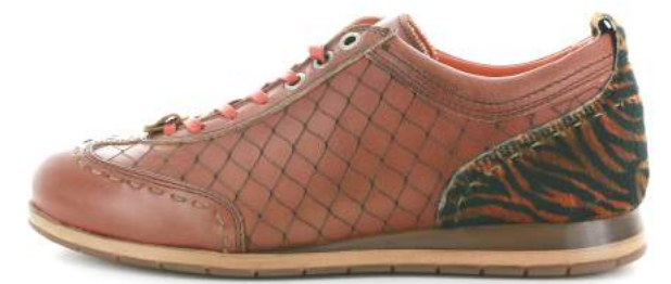
LASER - NERO TIGRE