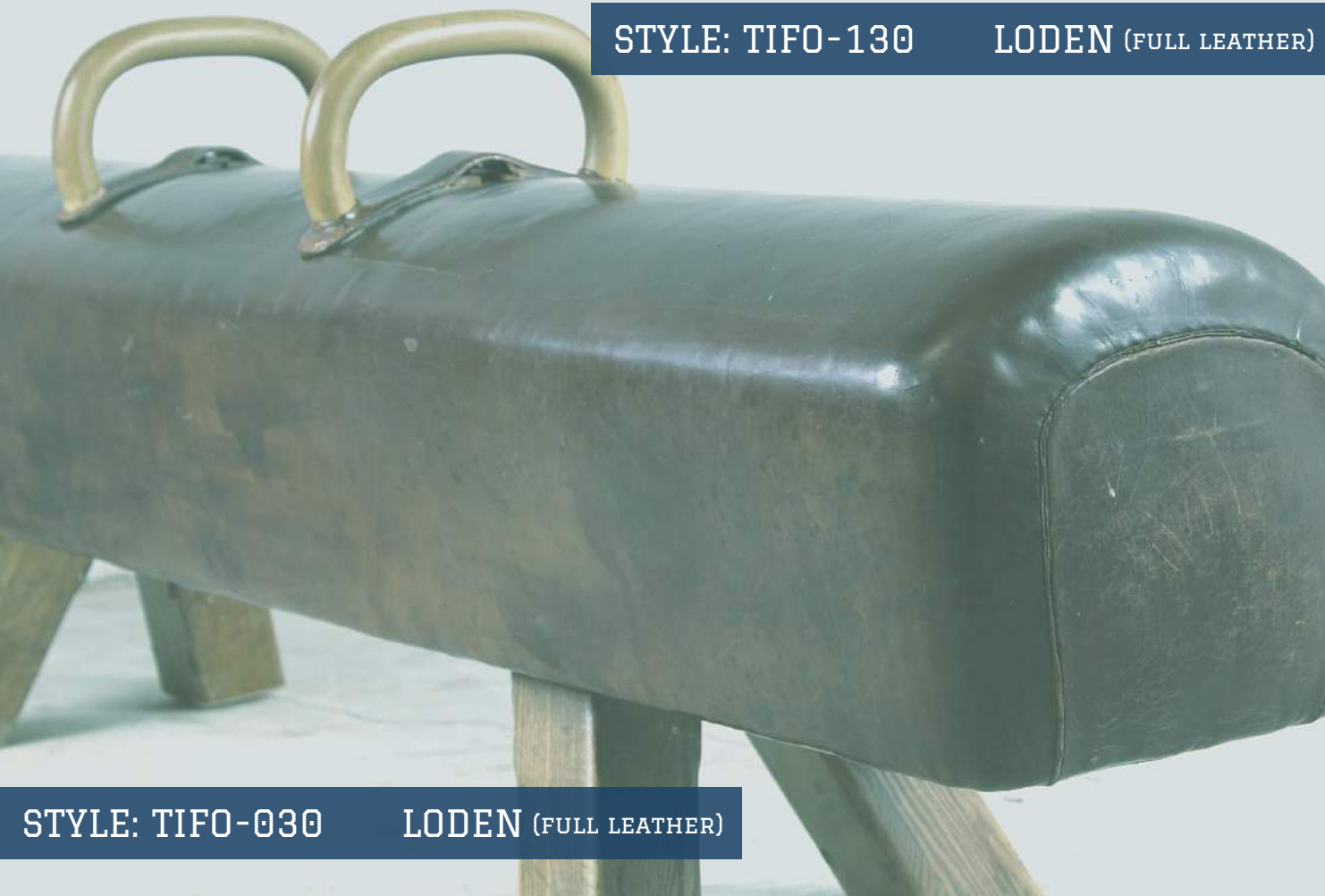
STYLE: TIFO-130 LODEN (FULL LEATHER)