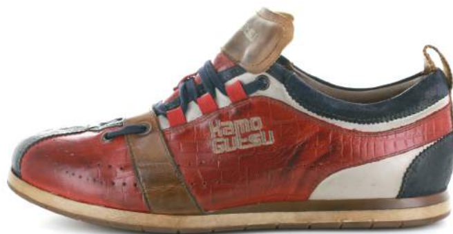
BLU + COCCO ROSSO