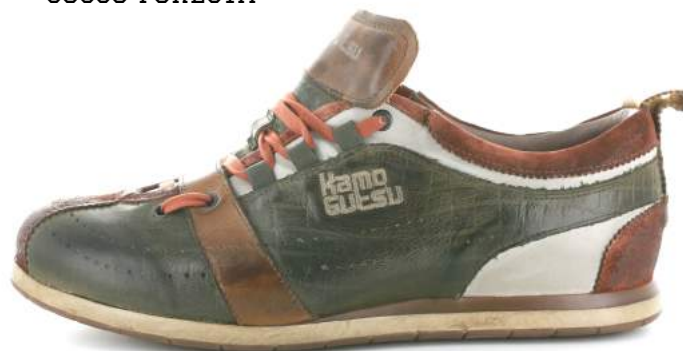
MATTONE + COCCO FORESTA