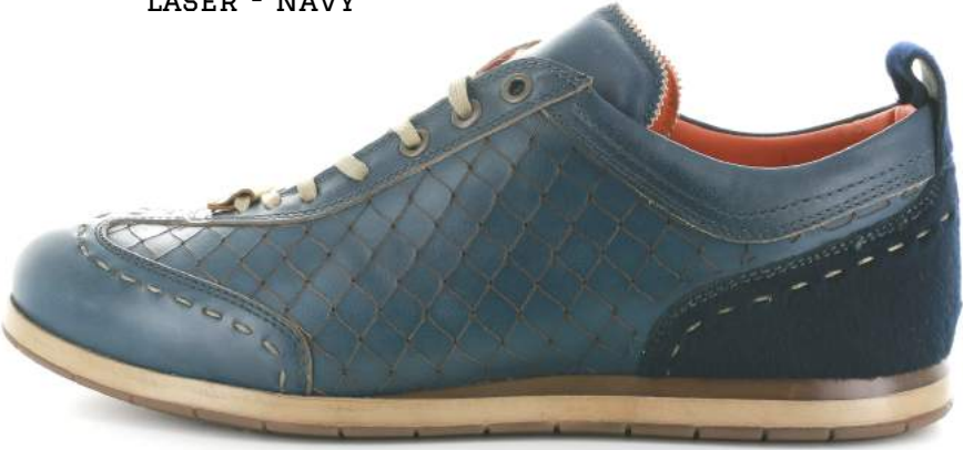
LASER - NAVY