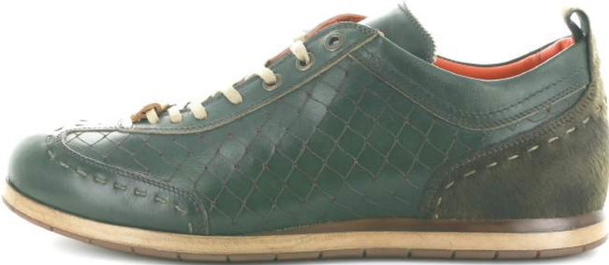
LASER - BOTTIGLIA