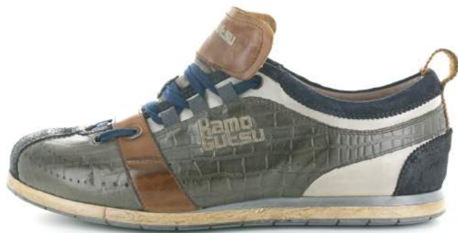
BLU + COCCO FUMO