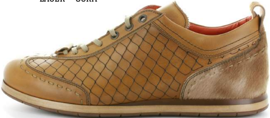
LASER - OCRA