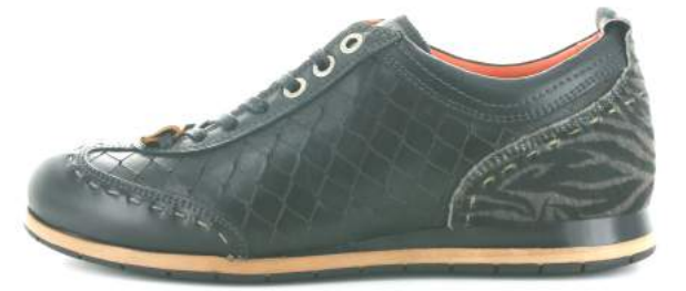
LASER - PRUGNA TIGRE