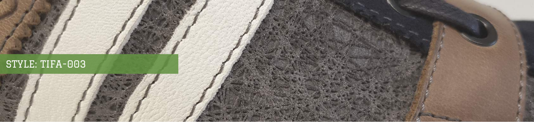
BLU + CARBON