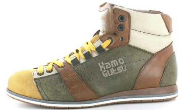
VELVET - RIBES - CAMEL